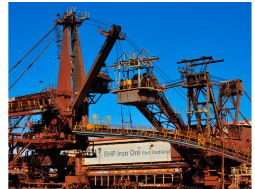
BHP Iron Ore Port Hedland

BHP Billiton are committed to the health and safety of their people, the environment and the communities in which they operate.